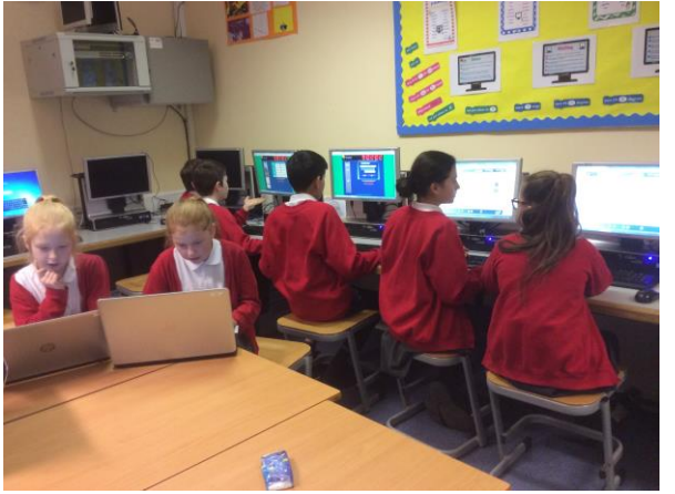
Pine Class using technology to solve 24 hour clock problems

This week in math's the children have worked hard on converting measures from ml to l, mm to cm, cm to m, m to km and g to kg and solving measures problems. They have also practiced the 24 hour clock. In art lessons the children designed the front cover for their Power of Reading Shackleton book. In English the children have polished their motivational speeches and have also been looking at the key features of newspapers, ready to plan their own newspaper report. Science has continued to focus on timing of paper helicopters to hit the ground and the factors needed to ensure it is a fair test. This has also been written up and conclusions drawn from their investigation. Volleyball skills were also very much enjoyed by the children!