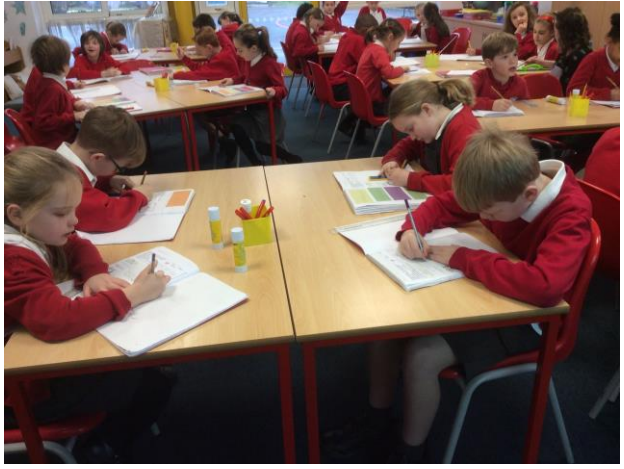
Maple Class are ordering fractions on a numberline.