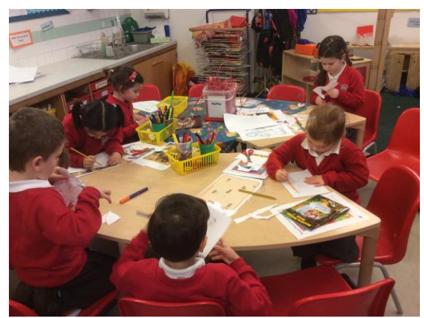
Children in Beech Class are concentrating hard on their drawing and writing skills

This week the children have enjoyed joining Sailor Bear on his travels to India and finding out more about the country and their customs. The children have experienced creating Mehndi hands and Rangoli patterns. They have also practiced Bhangra dancing in PE. The focus in math's has been on doubling numbers. The children also have enjoyed drawing and writing about animals found in India.