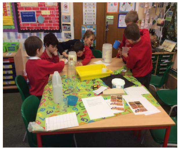
Hawthorne Class reading scales to measure the amount of liquid each container holds.