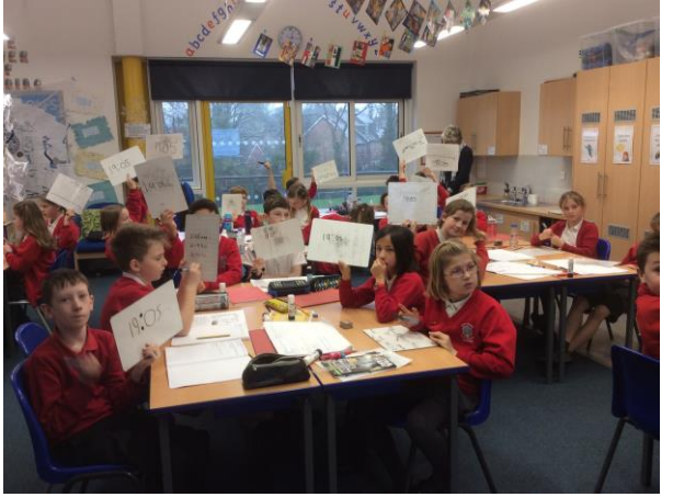
Willow Class eager to show off their knowledge of the 24 hour clock