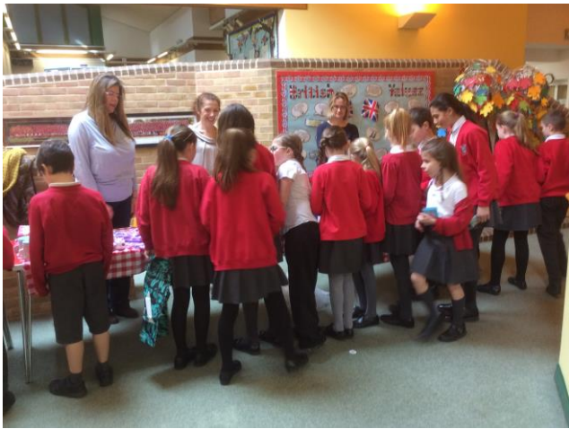
Children carefully choosing their gifts