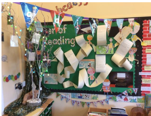
Hawthorn have worked hard on their writing.