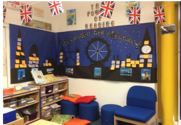
The London Eye Mystery is gripping Year 5/6!