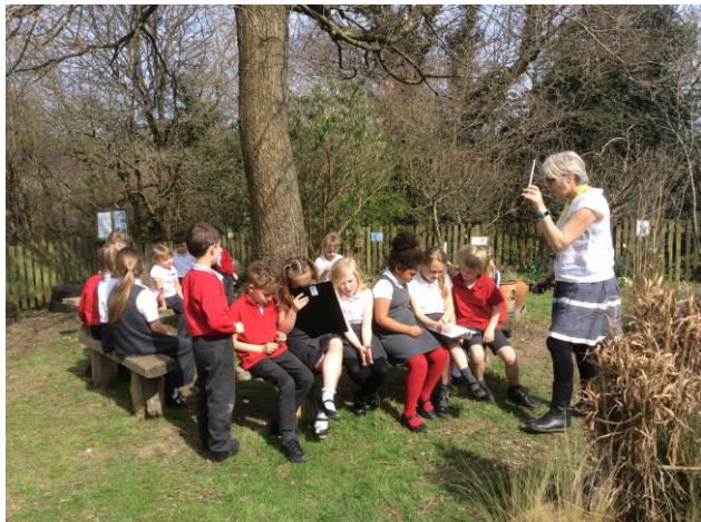
Elder Class looking at animal habitats and how they change during the year.