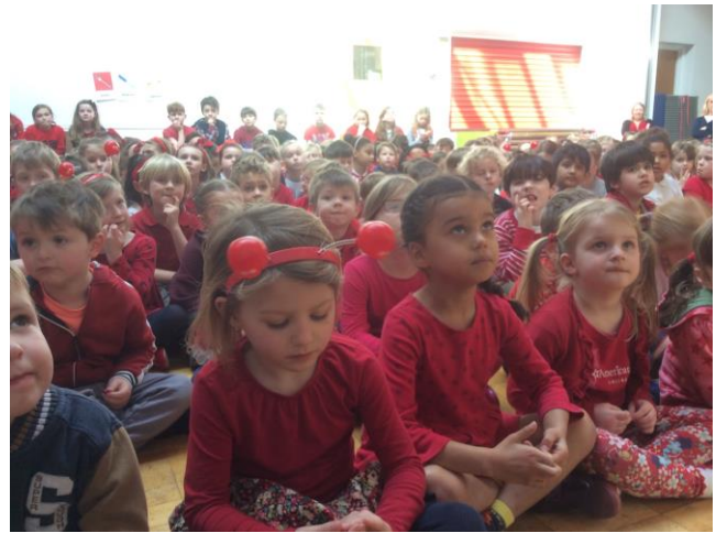
Red Nose Day – dressing up in red!