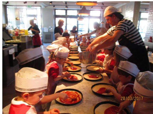
Damson Class enjoying making their own pizza!