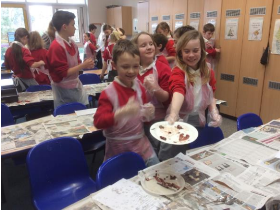
Willow class enjoying the mummification of fish!

The Year 6 children were very excited to be mummifying fish this week, just as the Ancient Egyptians did to important people. I think it is fair to say that it fascinated the children, especially seeing and taking out the innards of the fish! In maths the children have collected data and practised interpreting pie charts and finding the mean of a data collection. Science has focused on writing up their investigations, including creating graphs to show their results. Emotion poems have been created, as well as continuing to read and enjoy their core text, "The Mystery of the London Eye."