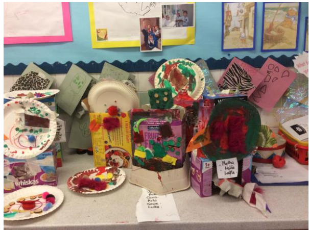
Just look at our Aliens!