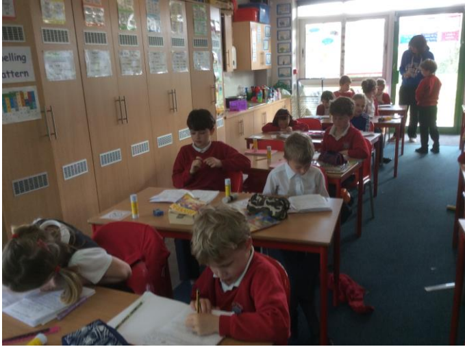
Oak Class writing questions to ask the "old lady" from their core text "The Ice Palace."

Year 3 / 4 have thoroughly enjoyed investigating circuits in science lessons, adding motors as well as light bulbs to their series circuits. They have been learning about Roman numerals time in maths, solving problems using reasoning, as well as explaining their answers. The children have also looked at the differences between formal and informal letters and also thought about a character's feelings and emotions, using drama as a stimulus. In PE outdoor adventure and swimming have been enjoyed. Spelling, punctuation and grammar have also been an important focus of the week.