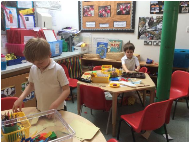
Reception children enjoying being creative

This week the children have enjoyed using the outdoor environment in the sunshine! They have been exploring what happens if you drop stones from different heights and if a stone is heavier or lighter what happens then. They have also been on a walk in our beautiful woods and grounds looking for signs of Spring. The children are gaining confidence in writing and many are now able to write letters and sound out the spelling of words using their phonics knowledge. In maths addition and subtraction have been the focus. The children are very proud reading their special books in phonics sessions. Fine motor skills have been encouraged through cutting and pinching and snipping playdough.