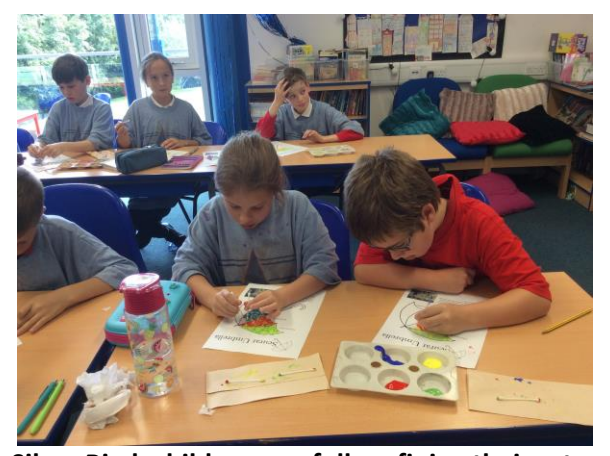
Silver Birch children carefully refining their art work

Year 5 / 6 children wrote a description of a setting in relation to their core text "Rooftoppers." They used editing stations to improve their descriptions focusing on punctuation, grammar, vocabulary, spelling and peer editing. In maths the children