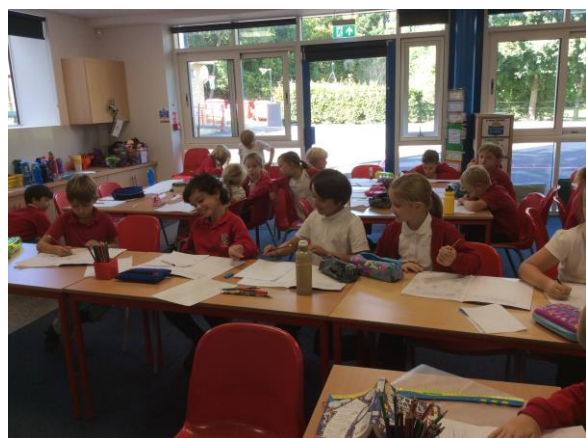
Juniper Class discovering what makes a healthy diet