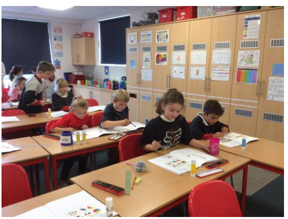
Maple Class colour mixing using paint in their art lessons.