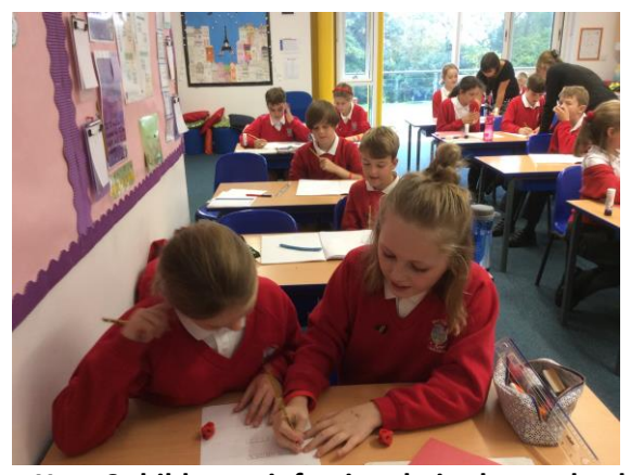
Year 6 children reinforcing their place value knowledge