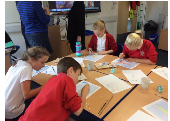
Pine Class practising Pointillism art