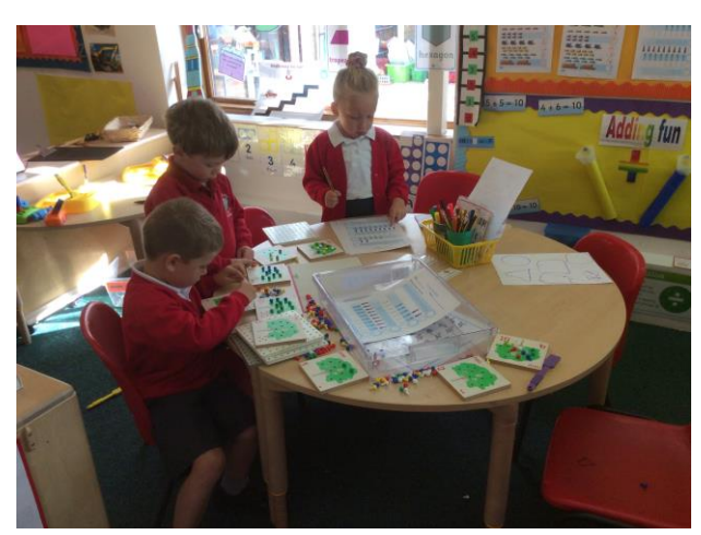
Beech children concentrating hard on their number work.

This week Reception children have been busy identifying rhyming words and writing their own Monster Poem. They have also enjoyed using the bikes and scooters to support their balance and developing their motor skills. Children have also practised careful 1 – 1 counting and matching the total to the correct numeral. Visits to the mud kitchen have also been a much waited for activity!