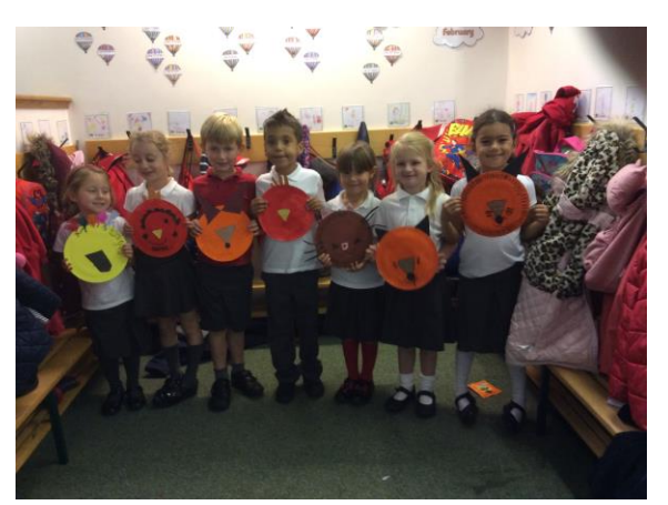
Chestnut Class have been making masks ready for Harvest Service

This week Year 1 have been busy making animal masks for our Harvest Service and have also enjoyed printing with vegetables. In maths the children have been learning about the language of more than and less than and comparing numbers. They have also written their own version of the story "The Sweetest Song." In DT the focus was on tasting fruit ready to make a breakfast for a friend. The children practised their gymnastics and rugby skills in PE lessons.