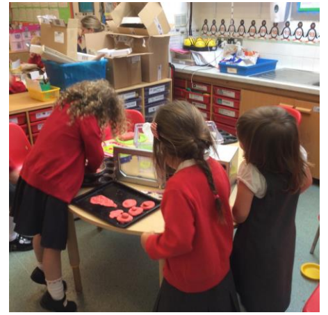
Ash Class enjoyed using play dough to make biscuits and cakes!