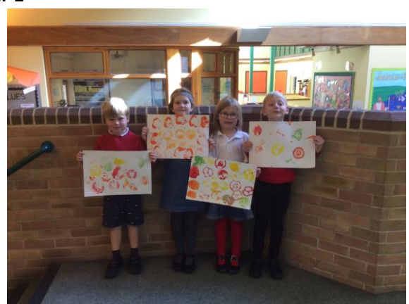
Teddy, Millie, Caris and Dylan are very proud of their vegetable print pictures