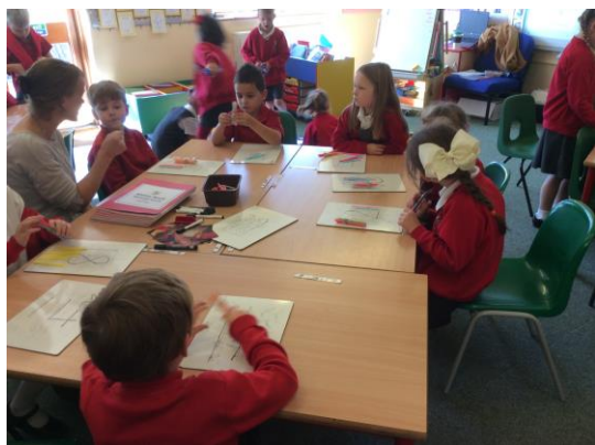
Elder Class identifying how many tens and ones in a number.

Year 2 Year 2 children have enjoyed starting their new core text “The Snail and the Whale” and were very enthusiastic acting out parts of the story and drew story maps to show the story sequence. They have also tried to use descriptive language with a focus on adjectives. In maths the children have been learning about place value, identifying the number of tens and ones in a number, partitioned two and three digit numbers and matched the numerals to numbers written in words. In science the children have sorted things in our woods into living, dead and things that have never been alive. The children have practised their sketching skills in art and enjoyed gymnastics moving in straight pathways.