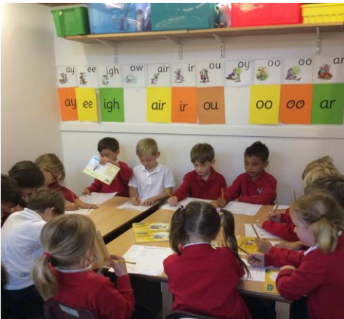
Year 1 practising phonic reading skills

Year 1 This week Year 1 have been identifying different parts of the human body in science. They have practised their number bonds to 10 and representing numbers in different ways. Reading skills using phonics have been a focus and the children acted out the story of “ the Sweetest Song” from their text “ The Story Tree” and they also drew story maps to show the sequence of the story. In PE the children have used balances and ball skills. They have drawn self portraits in art.