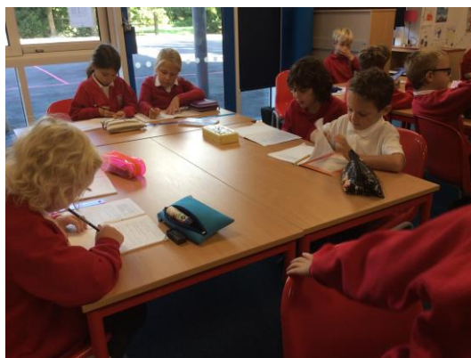
Juniper children writing their poems.

Year 2 Year 2 children have enjoyed starting their new core text “The Snail and the Whale” and were very enthusiastic acting out parts of the story and drew story maps to show the story sequence. They have also tried to use descriptive language with a focus on adjectives. In maths the children have been learning about place value, identifying the number of tens and ones in a number, partitioned two and three digit numbers and matched the numerals to numbers written in words. In science the children have sorted things in our woods into living, dead and things that have never been alive. The children have practised their sketching skills in art and enjoyed gymnastics moving in straight pathways.