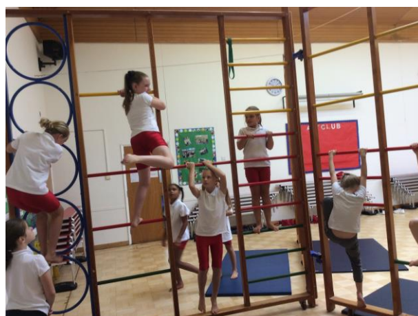
Oak children enjoying climbing & balancing in PE

Reception – Reception children have settled very well and getting to know each other. They have enjoyed talking about their favourite things to do. The children have been thinking about similarities and differences between children. They have practised counting 1-1 and using different shapes to make cars. There was great excitement this week when the children found a toad hiding in the sand / water toys! “Robert the Toad” was released in the woods safe and sound. Today the children enjoyed using the mud kitchen.