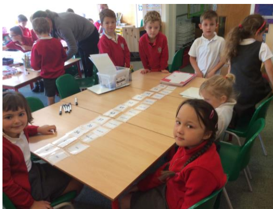
Hawthorn children matching numerals to numbers written in words.

Year 5 / 6 This week the children have been learning all about evolution in science and researching about Darwin. They are gripped by their new core text “Rooftoppers” and have made initial suggestions about the two main characters at the start of the story. The children have developed their thoughts using speech and dialogue. In maths place value has been the focus for Year 5 with negative numbers for Year 6 and problem solving. Colour mixing using Pointillism has been practised in art. Year 5 / 6 have started to learn all about the Mayans and where they settled in Central America during history lessons. The children have also been trying to improve their rapid recall of times tables using “Rockstar” a very competitive game!