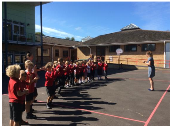
Lime Class counting and jumping to multiples of 5 and 10.

Year 3 This week Year 3 have focused on place value and counted in multiples of 5 and 10 to over 100 in maths. They have been reading and performing poetry in English lessons. The children have been learning about nutrition in science and the focus in PE has been netball skills and gymnastics. They have learned about Islam in RE.