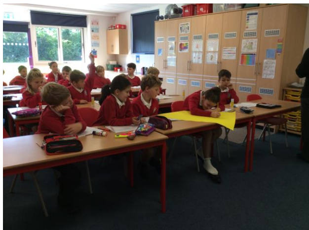
Maple Class suggesting character traits

Year 4 –This week Year 4 have enjoyed solving place value problems in maths. They have practised sketching using shading in art. The children have been learning about orienteering, outdoor adventures and gymnastics in PE. In English lessons the children have started to read their new core text is “Oliver and the Seawigs” and have been thinking about the characters and designing an “exploremobile.” They have also brought 3 items into school that they would take with them and justified why.