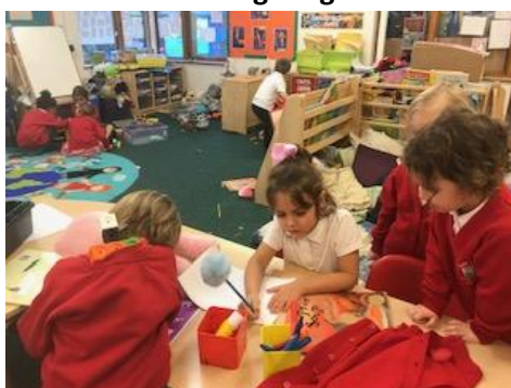
Beech Class writing letters