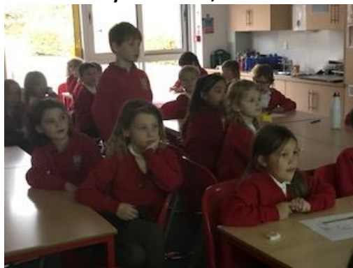
Lime Class investigating a crime scene!