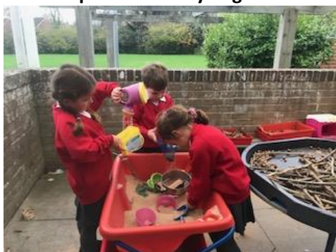
Damson Class enjoying "Golden time!"