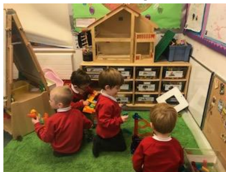
Ash Class working together