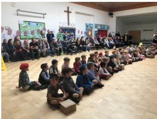
Waiting for a Ration cake!