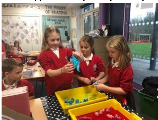
Maple Class tie dyeing!

What happens in Holy Trinity Primary School on a Friday afternoon, at the end of a busy week?