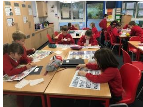
Juniper Class making a comic strip