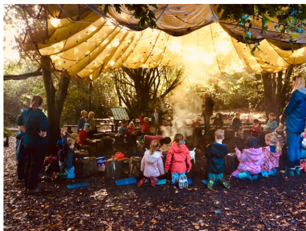
Chestnut Class enjoying "Forest Schools!"

What happens in Holy Trinity Primary School on a Friday afternoon, at the end of a busy week?