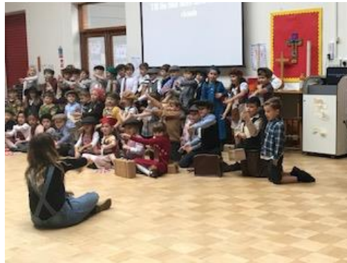
“We’ll Meet Again”