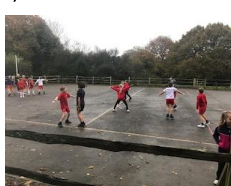
Oak Class enjoying warming up in PE