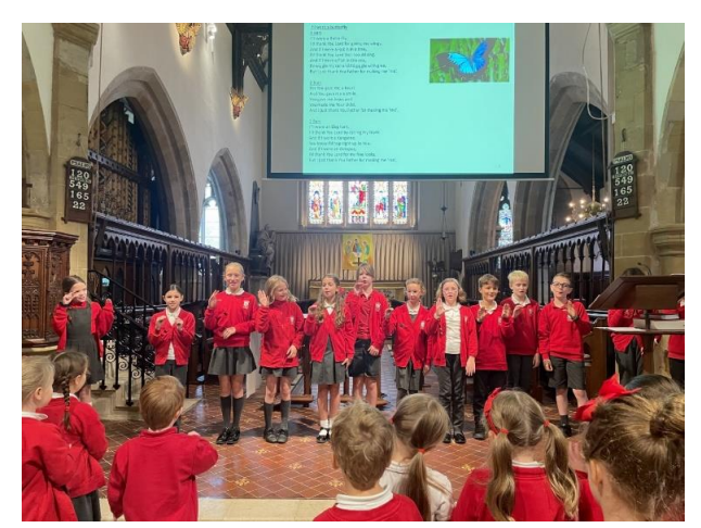
Year 6 Ambassadors helping KS1 at their Harvest Service