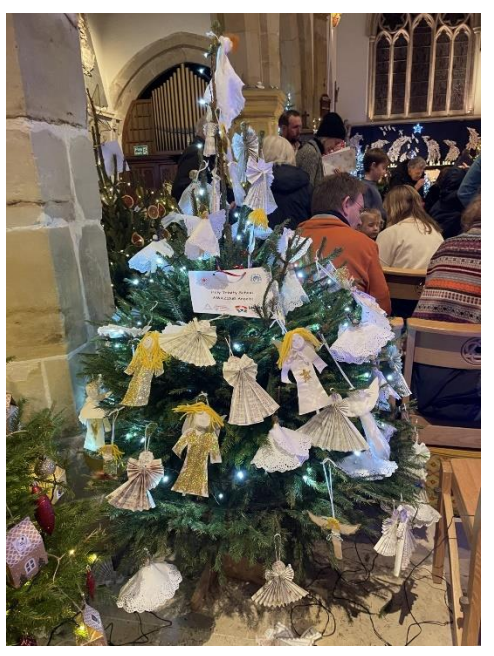
Key Stage 2 Christmas tree