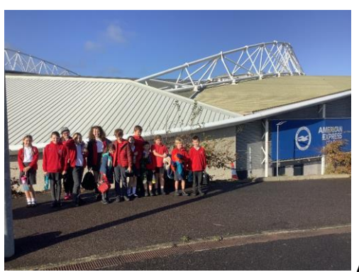
Arriving at the AMEX

Thank you to the West Sussex Autism and Social Communication Team (ASCT) for organising such an informative and enjoyable day. Thank you to HET for the free transportation to and from the event.