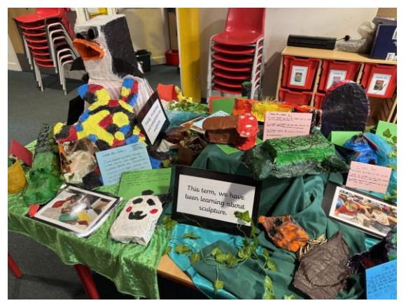
Year 4 made sculptures