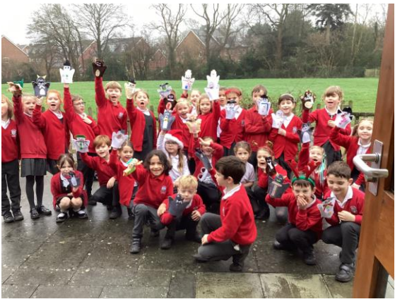
Year 2 with their hand puppets