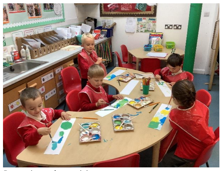
Reception colour mixing