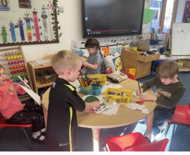
Reception children are still working hard!