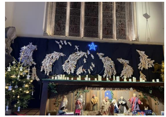
Holy Trinity Primary School's "Inspiring Angels" project at Holy Trinity Church