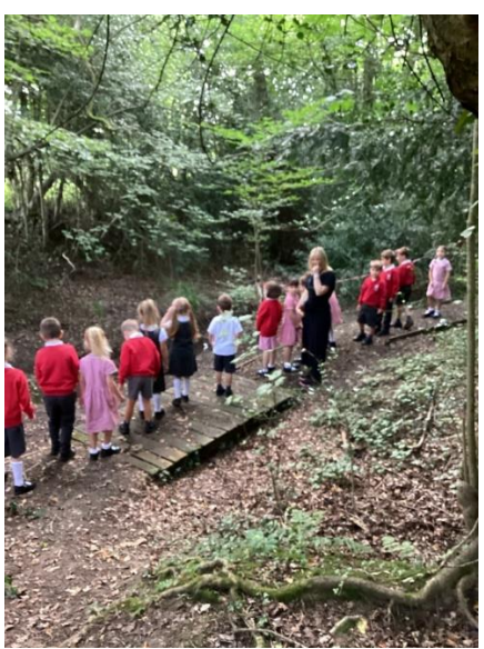
Year 1 looking for Bog Baby in the school grounds

Reception were visited by Haywards Heath Fire service