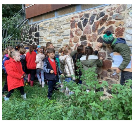
Year 3 at Lewes Railway nature park